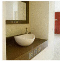
Look4Design.co.uk Ads by Google